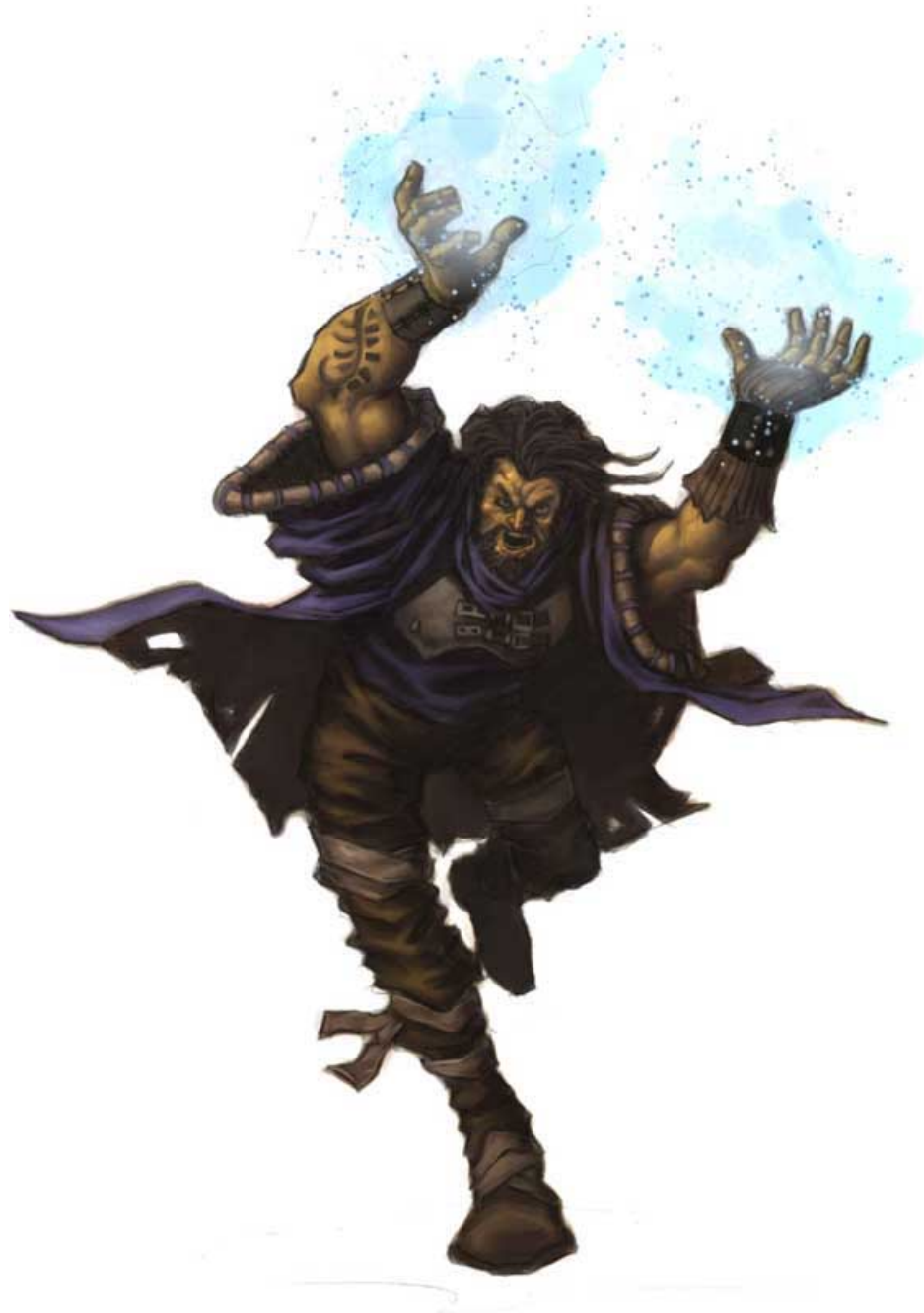
BLUE REFUGEE WIZARD

Below is one of the sketches from the Onslaught Style Guide, which is a document given to artists that worked on the set for reference. This sketch shows a "refugee" Wizard, meaning one that is not involved in the Pit-Fights. This Wizard is very "human" looking, unlike the Wizards in Legions . The Wizards in this block's later sets have started "liquifying" as part of the Mirari's influence over the races of Otaria.